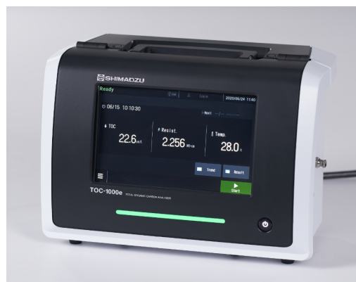
Fig. 1 TOC-1000e