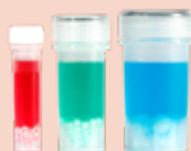
Lysing kits consumables