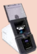
Minilys for personal use