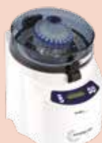
Precellys® 24 for high throughput