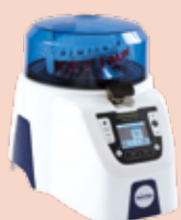
Precellys® Evolution Super Homogenizer